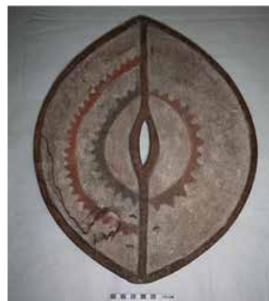
Picture of Ndoome front side and backside.

Third, the traditional initiation period was an opportunity for building household responsibility and community unity. Young men were taught to be