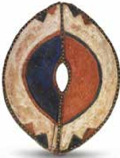
A picture of Ndoome (front side) clearly shows the three colours namely, ochre, white and dark blue.