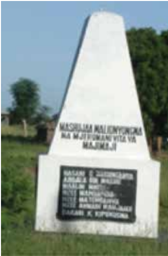
The Maji Maji Memorial Monument in Kilwa with the name of Chief Hassan Omar Makunganya

Back home, the name Makunganya is fading from historical records owing to the appropriation of the past. The inclusion of Chief Makunganya's name on the emancipation monument is contested not only because it is misplaced, but has been used to cover up the trading of the skull of this supreme chief which is here argued as dehumanization and shaming of the African body. The construction of the monument was a result of the political movement of Chama cha Mapinduzi (CCM) in its attempt to commemorate the victims of German colonialism during the Maji Maji War. As such, the inclusion of Chief Makunganya contradicts the available records of the coastal resistances and the Maji Maji War.