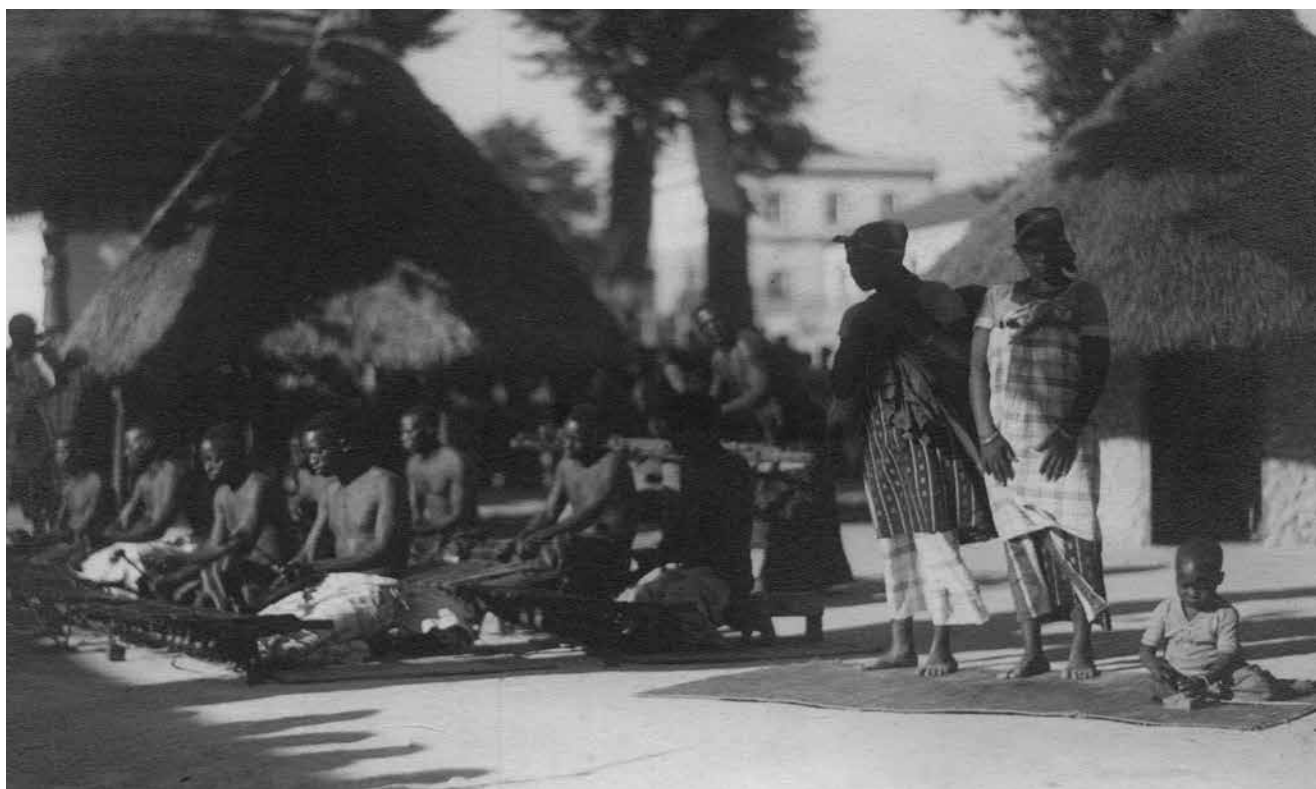
Peoples from Mozambique, the "marimba players", exposed in the 1st Portuguese Colonial Exhibition, (Porto, 1934).

Effectively, 18 individuals of Chope origin, together with other groups of people from other regions of the then Mozambique colony, were selected and shipped for the participation in this event. Just like other hundreds of persons (around