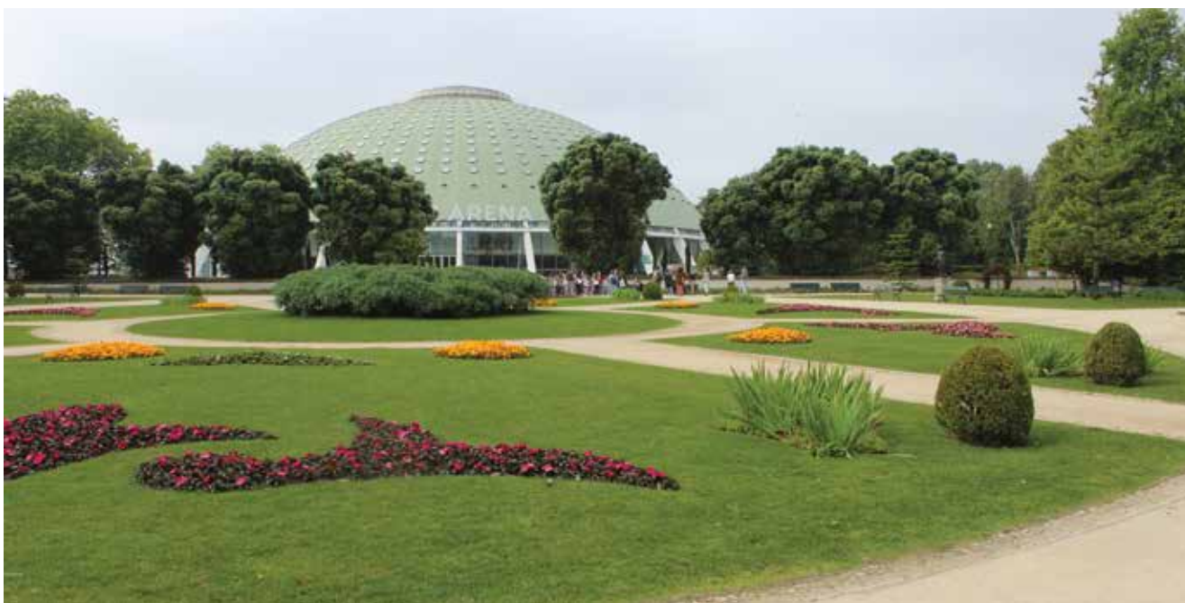
The Gardens of the Crystal Palace, the place where the 1st Portuguese Colonial Exhibition took place in 1934. Since 1960, the old palace was demolished and replaced by a sports arena maintaining, however, the gardens as a public space.

also the question of the hyper-sexualisation of the feminine body stands out as in the case of a young woman from Guinea-Bissau, nicknamed 'Rosita' by the press of the time